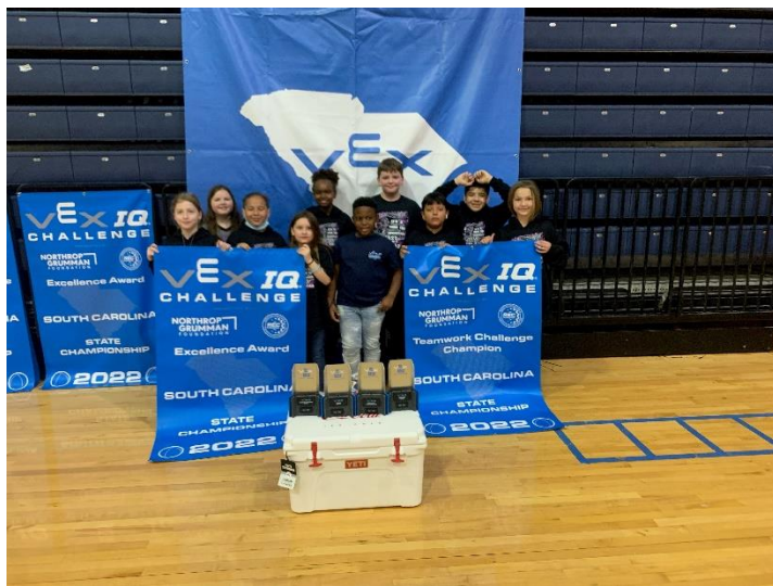
The robotics teams from RLOACS at the VEX IQ competition.

The Charter Institute at Erskine is the fastest-growing charter school authorizer in South Carolina. Serving 26 schools and 24,000 students across the state, the Charter Institute at Erskine is committed to innovative, creative, high-quality methods of education. For more information about the Institute, please visit www.erskinecharters.org .