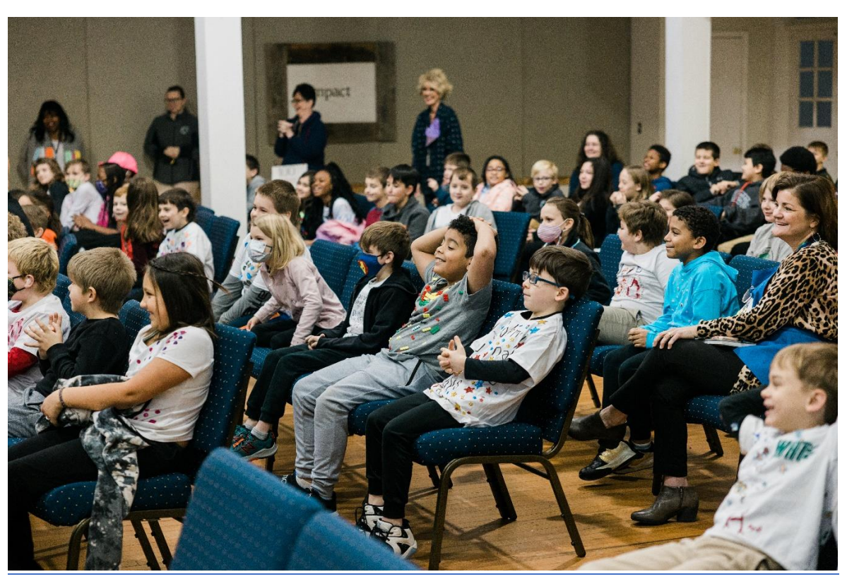
The students and staff at Summit wait anxiously for the Excellence award to be announced.