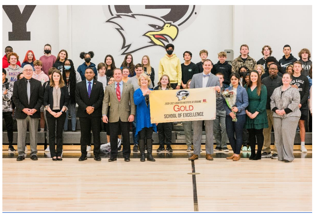
4The adminstration at Gray and the Charter Institute at Erskine's leadership and Accountability team pose with the students at Gray.