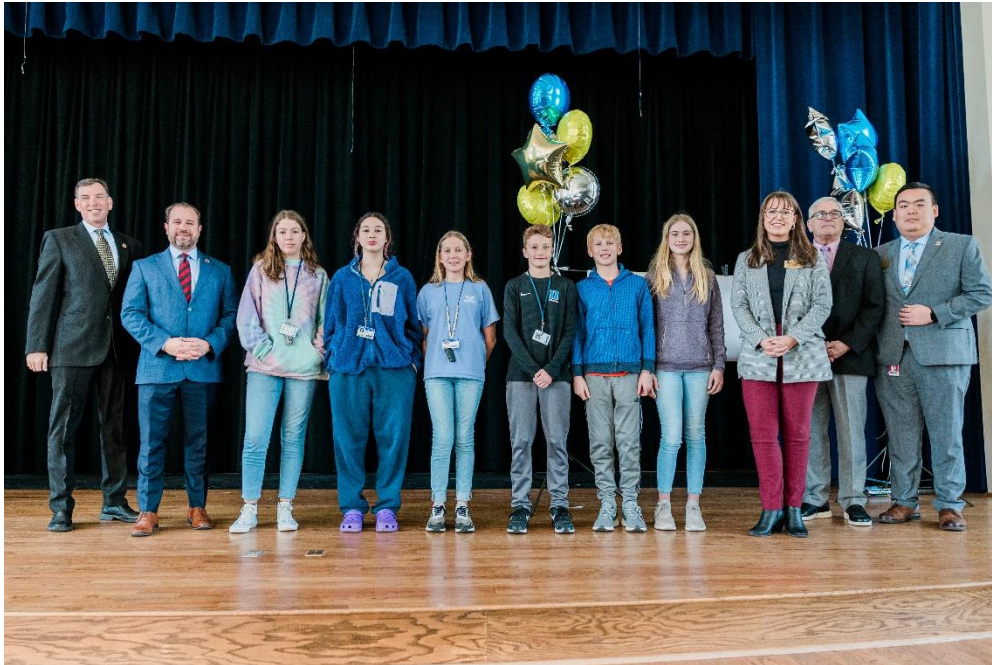
A group of students was recognized for achieving perfect scores on their SC standardized tests.