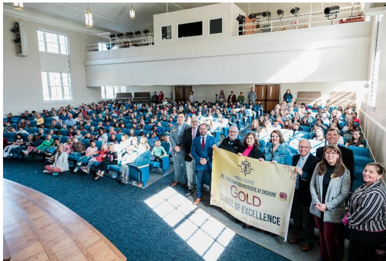
Leadership from the Institute and TCS celebrate with students, staff, and teachers.