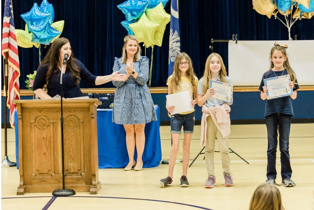
Ms. Lang recognizes elementary students for achieving perfect reading sub-scores on the state test.