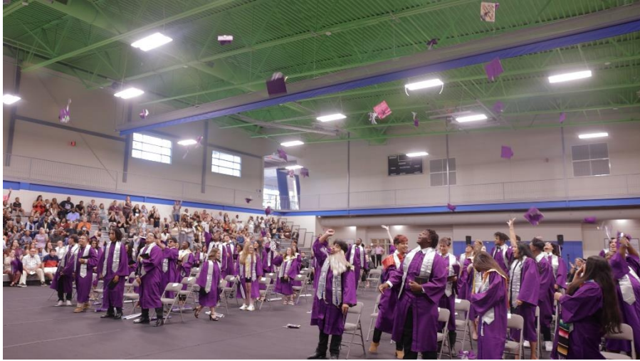
The RLOACS Class of 2022 toss their caps after receiving their diplomas.