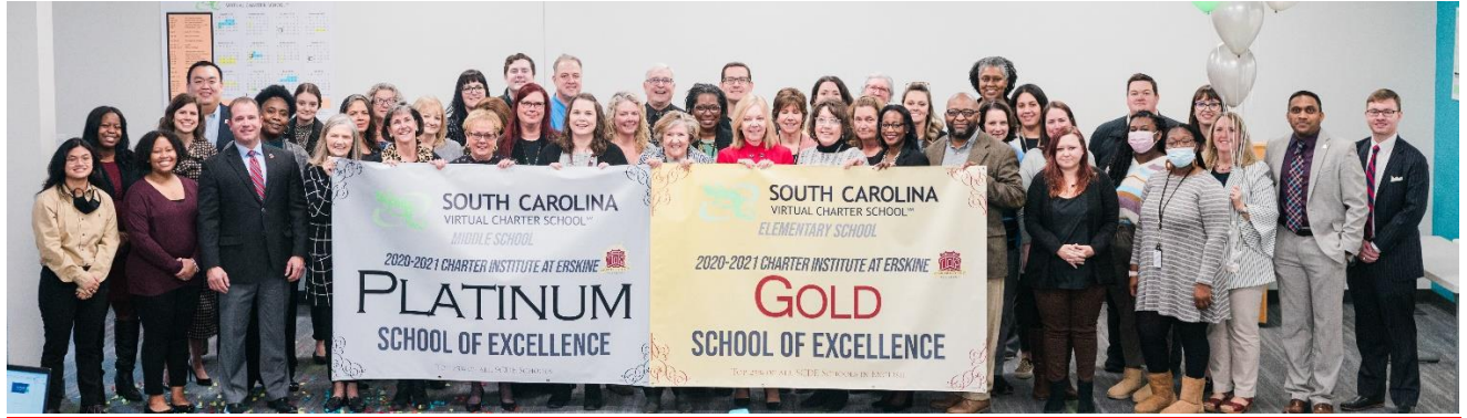
South Carolina Virtual Charter School's leadership, Board, and staff posing with members of the Charter Institute at Erskine team.